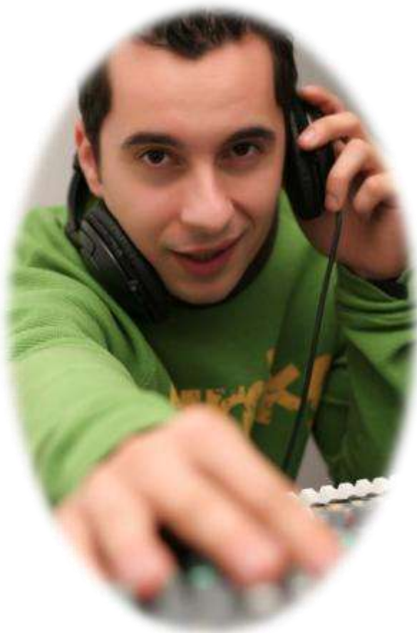
Primary Musical Activity